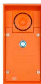
2N® Helios Safety