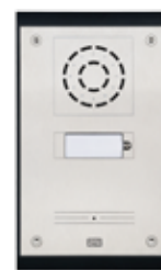
2N® Helios Uni