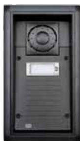
2N® Helios Force

Using the services of the existing analogue exchange not only saves costs on a new solution, but also offers a better quality and wider range of services, e.g. out-of-office redirect (to another office, voicemail, etc.) or putting a call through (e.g. from the secretariat to a particular person).